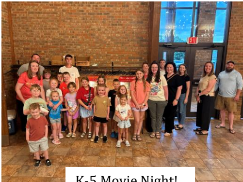
K-5 Movie Night!